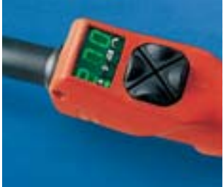
JobMaster with integral remote-control functionality