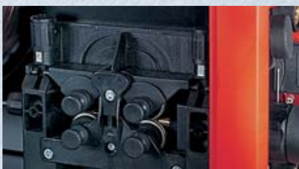
4-roller drive integrated within the power source, for smooth, precision wirefeed