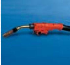
"PT-Drive" push-pull manual welding torch